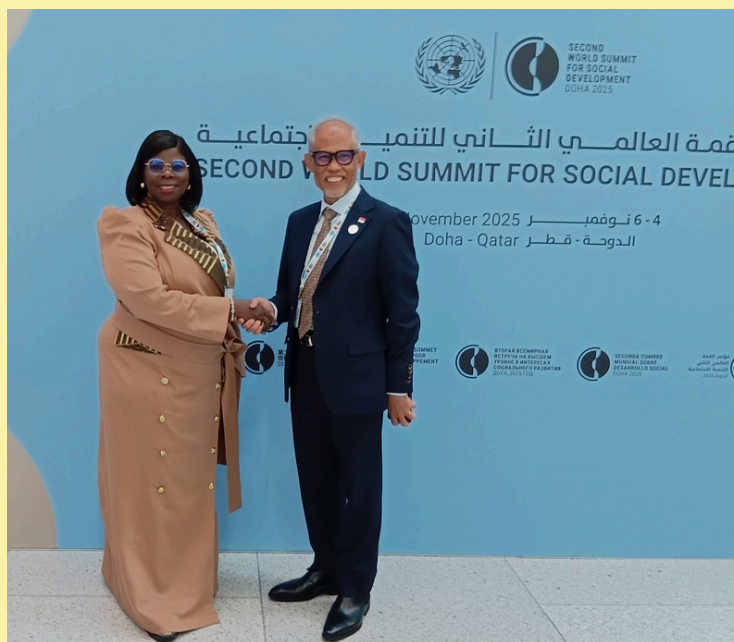
With Singapore's Minister of social development, Masagos Zulkifli

These moments reflect the strength of global collaboration advancing inclusive and sustainable transformation worldwide.