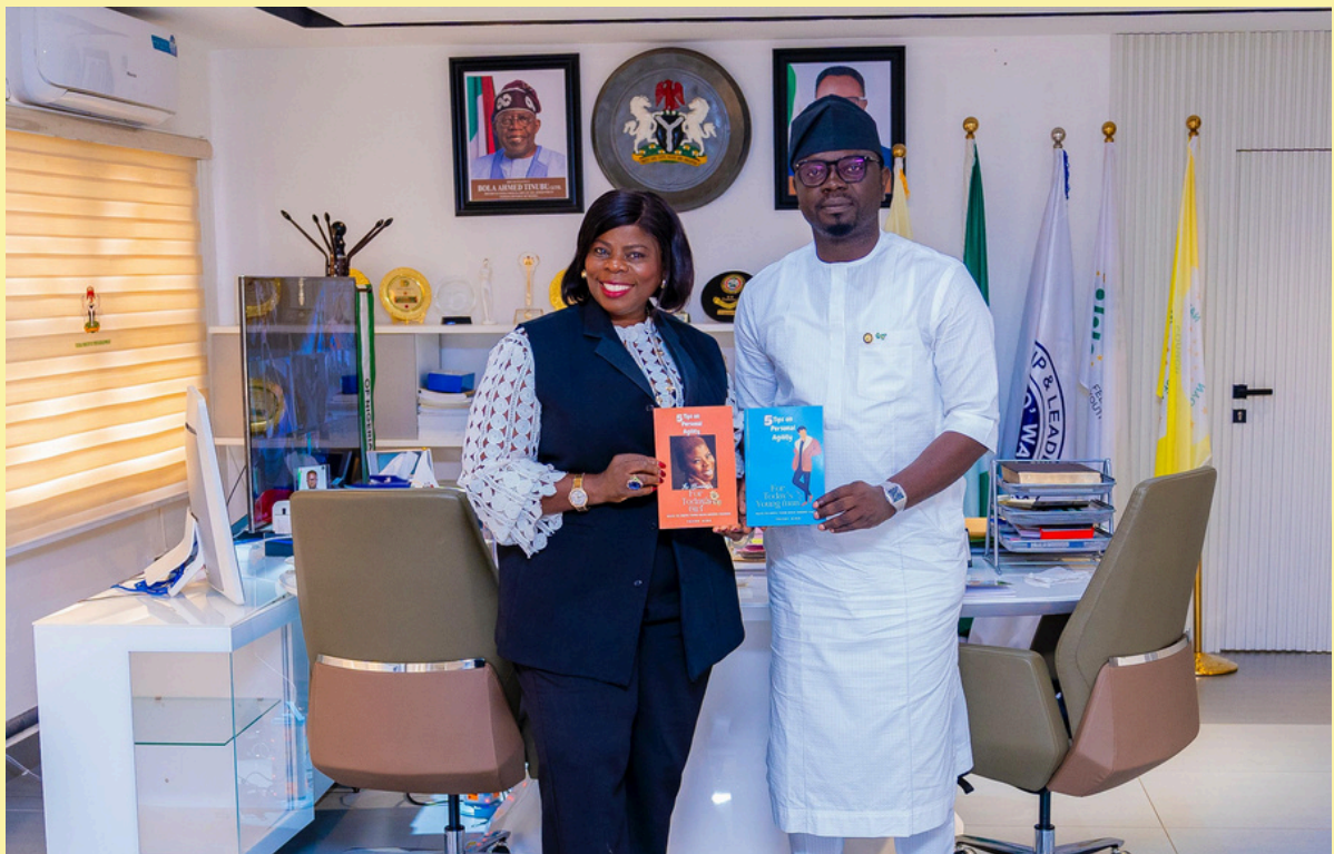
Photo with Honourable Ayo Federal Minister of Youth and Social Development Nigeria