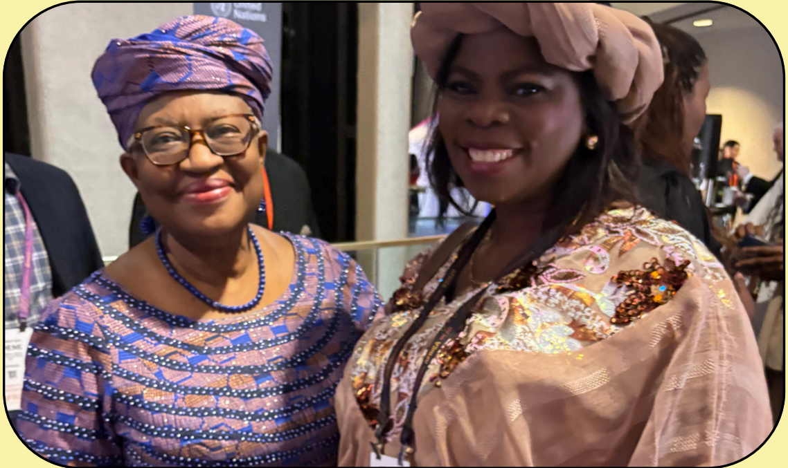
With Director General World -Trade Organisation

Unstoppable Africa stands as the premier African-convened business forum outside the continent, hosted by United Nations Secretary-General António Guterres and H.E. Mahmoud Ali Youssouf, Chairperson of the African Union. Took place on 21–22 September 2025 during the 80th UN General Assembly in New York, it will unite African and global heads of state, business leaders, and top investors. This convergence of voices signals Africa’s determination to lead—not follow—in shaping the markets of tomorrow.