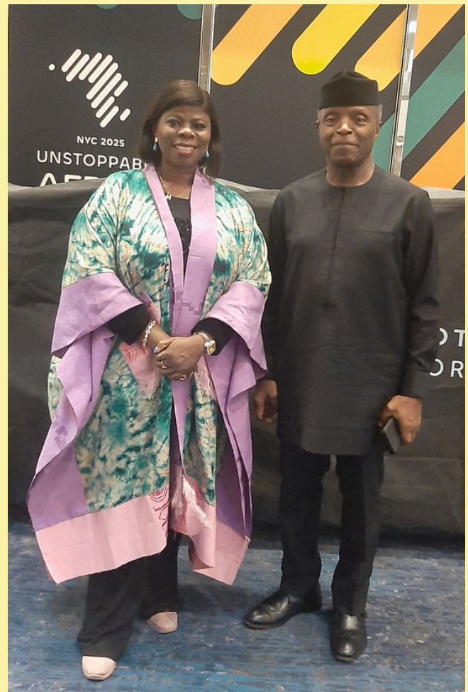
With Nigerian Former Vice President Professor Yemi Osibajo

By creating platforms for youth, women, and cross-border partnerships, GCLMUG demonstrates how African ingenuity can solve global challenges. It is a movement that embodies Africa’s unstoppable spirit of creativity, resilience, and transformation.