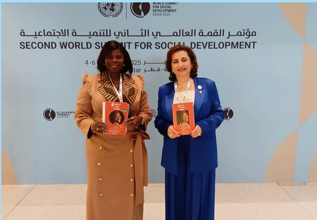
Photo with Executive Director of UN Women Sima Bahous holding my book

This moment reflected the power of dialogue in shaping inclusive futures."