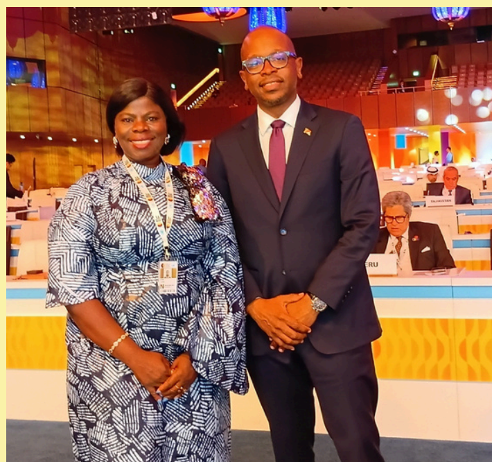
With the Ambassador of Seychelles to UAE