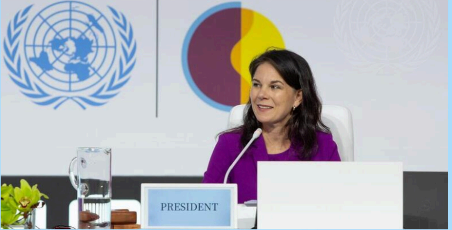
H.E Annalena Baerbock President United Nations General Assembly