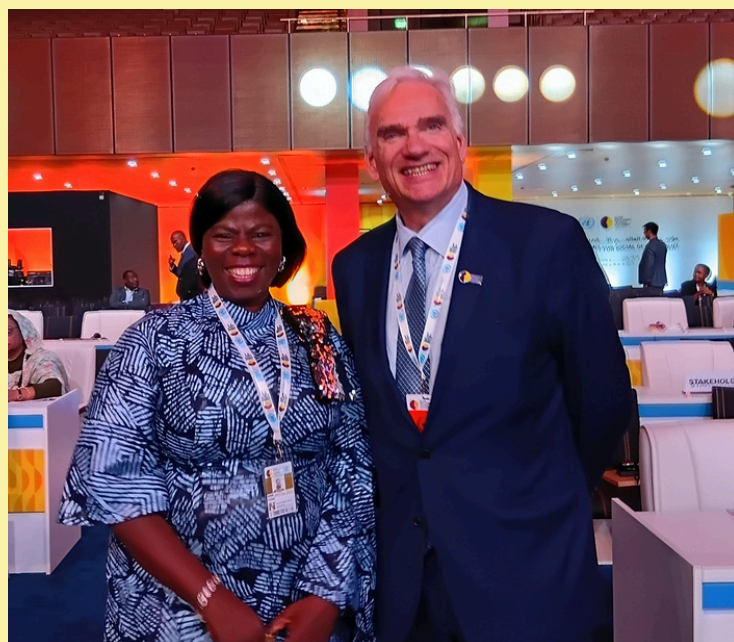
With IMF Chief -Special Representative of the IMF to the United Nations