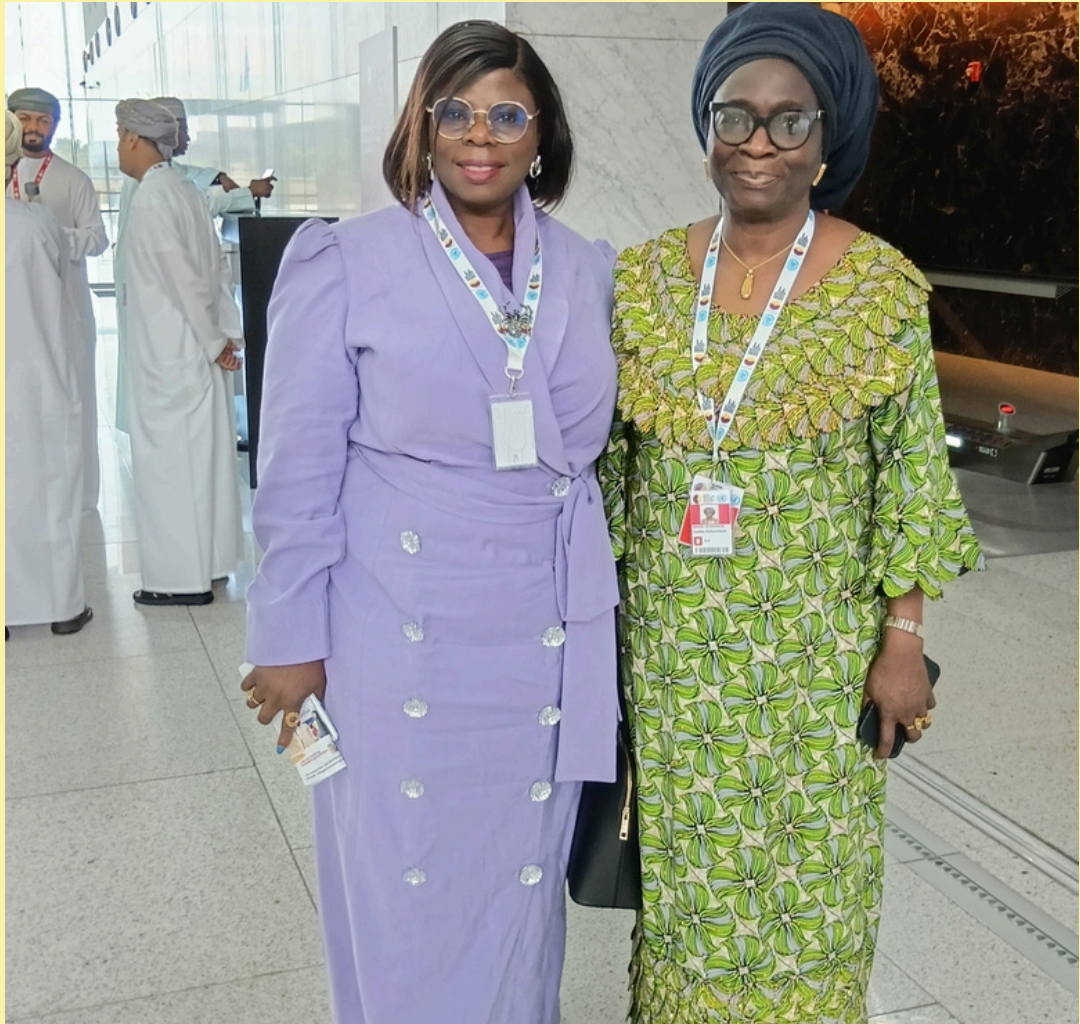
Photo with International Labour Organisation (ILO) representative to the United Nations