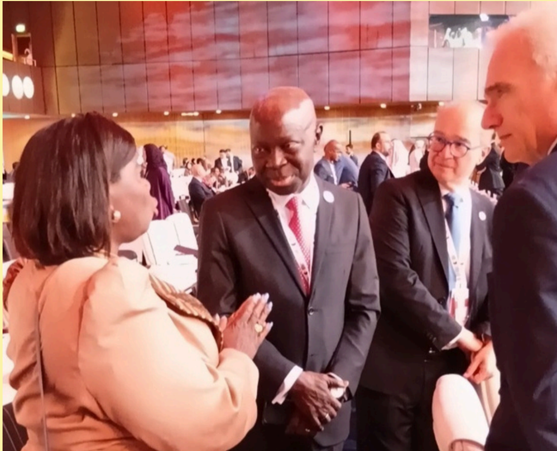
Dr. Gilbert F. Hougbo, Director-General of the International Labour Organization (ILO)

Advancing conversations on inclusive growth, economic empowerment, and sustainable social development at the World Summit in 2025